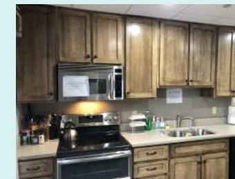
We got a new stove and kitchen sink along with ceiling height cabinets!