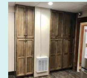
The new food pantry style custom cabinets are amazing!