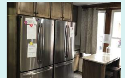
Two shiny new refrigerators and a counter-height island on wheels bring the project together!