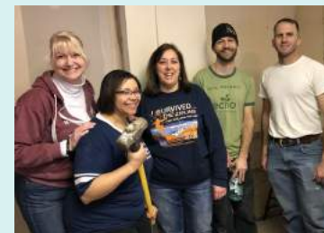
Members of Leadership Centre County and Penn State Athletics "deconstructed" the old Kitchen